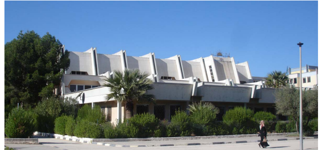
Clipping - Central Operation Department / Patient access